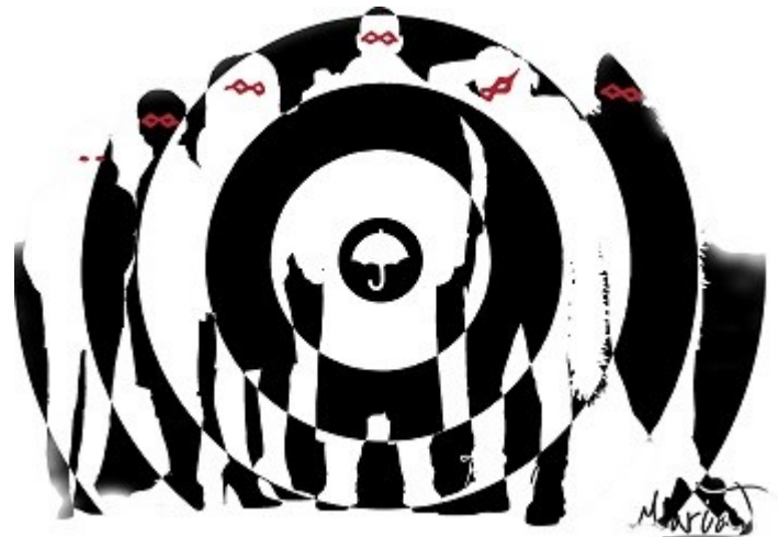
2023-2024 Unleashed Year's Best Illustration The Umbrella Academy