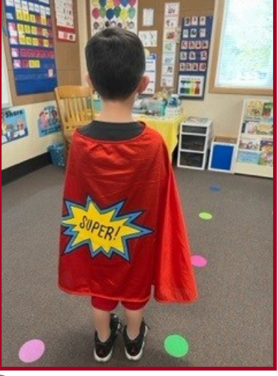
Pre-school Super Herol